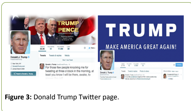
Figure 3: Donald Trump Twitter page.

Similarly, Harfoush observed that the Obama online campaign did reach new supporters, and promoted wider participation. Some other notable social media that have acquired significance in political campaigns is the Twitter, which sustains more than 328 million monthly active users across the world [41]. Twitter, allows users to post and read statements, thoughts, and links in 140 characters known as tweets. This has made it a user-friendly tool for politics and political campaigns [42]. According to Levy [43], more than a billion tweets related to the election were posted during the 2015–16 U.S presidential campaign ( Figure 3 ).