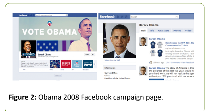
Figure 2: Obama 2008 Facebook campaign page.

Indeed, the use of web-based social networking systems, for instance, Facebook, Twitter and YouTube in the electioneering campaign can never be overemphasized [37]. For example, social media such as Facebook allow users to partake in their political beliefs, support a specific candidate and interact with others on political issues [1,9,13,14]. Specifically, evidence has indicated that a notable use of Facebook was during Obama's 2008 political campaigns. This was efficiently used to contact the group of the electorate, notably the young ( Figure 2 ).