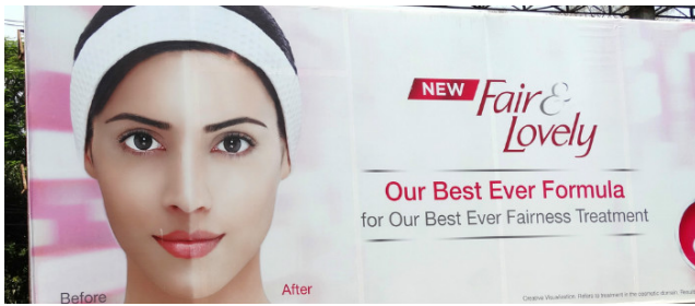
Figure 4: Light skin advertisement.

As reported in a study, music media associate light skin with high status and confidence [13]. This corroborates with Thompson and Keith [19] postulation which states that “the media has encouraged greater negative self-appraisals for dark skinned women.”