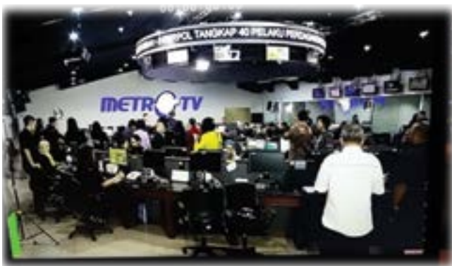
Figure 2 Newsroom Convergence at Metro TV.

According to the description above, Media Group's converged newsroom is designed between Metro TV, online, and Media Indonesia newsrooms. This has facilitated integrated coordinating system called super desk newsroom convergence with open, walls-down design. It describes in details the things required to form a newsroom called information engine. This has