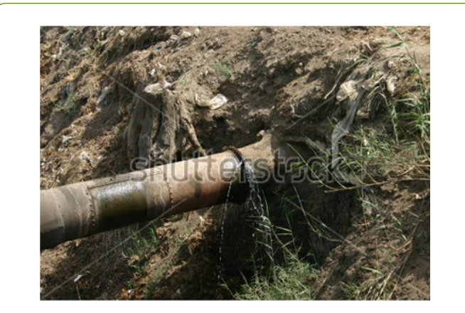
Figure 2: Typical water pipe embedded in dirty sand within a dirty environment which will corrodes and contaminates water in the pipe.

There is also available information on the fact that due to poorly maintained water distribution infrastructure, there is a serious problem of uncontrolled high level of pollution caused by water contamination as a result of defective and deteriorating water distribution systems as depicted in Figure 2 .