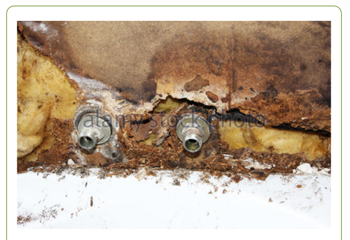
Figure 3: Typical old and corrosive pipes which are not good for water distribution because they must have been contaminated. Drinking from this source will definitely cause health hazards. It is also a source of water borne diseases.