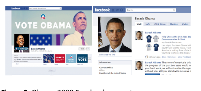
Figure 2: Obama 2008 Facebook campaign page.

Indeed, the use of web-based social networking systems, for instance, Facebook, Twitter and YouTube in the electioneering campaign can never be overemphasized [37]. For example, social media such as Facebook allow users to partake in their political beliefs, support a specific candidate and interact with others on political issues [1,9,13,14]. Specifically, evidence has indicated that a notable use of Facebook was during Obama's 2008 political campaigns. This was efficiently used to contact the group of the electorate, notably the young ( Figure 2 ).