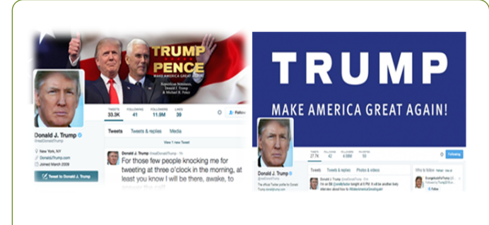
Figure 3: Donald Trump Twitter page.

Similarly, Harfoush observed that the Obama online campaign did reach new supporters, and promoted wider participation. Some other notable social media that have acquired significance in political campaigns is the Twitter, which sustains more than 328 million monthly active users across the world [41]. Twitter, allows users to post and read statements, thoughts, and links in 140 characters known as tweets. This has made it a user-friendly tool for politics and political campaigns [42]. According to Levy [43], more than a billion tweets related to the election were posted during the 2015–16 U.S presidential campaign ( Figure 3 ).